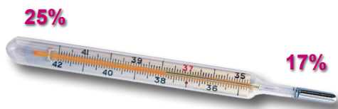
Bay Area Children Seeking Emergency Room Services Dropped From 2005 To 2007

Over 97% of Bay Area Children Are Now Insured