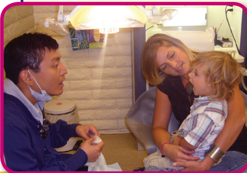
Because Of First 5, Santa Cruz County Exceeds The National Average For Children's Access To Health Care.